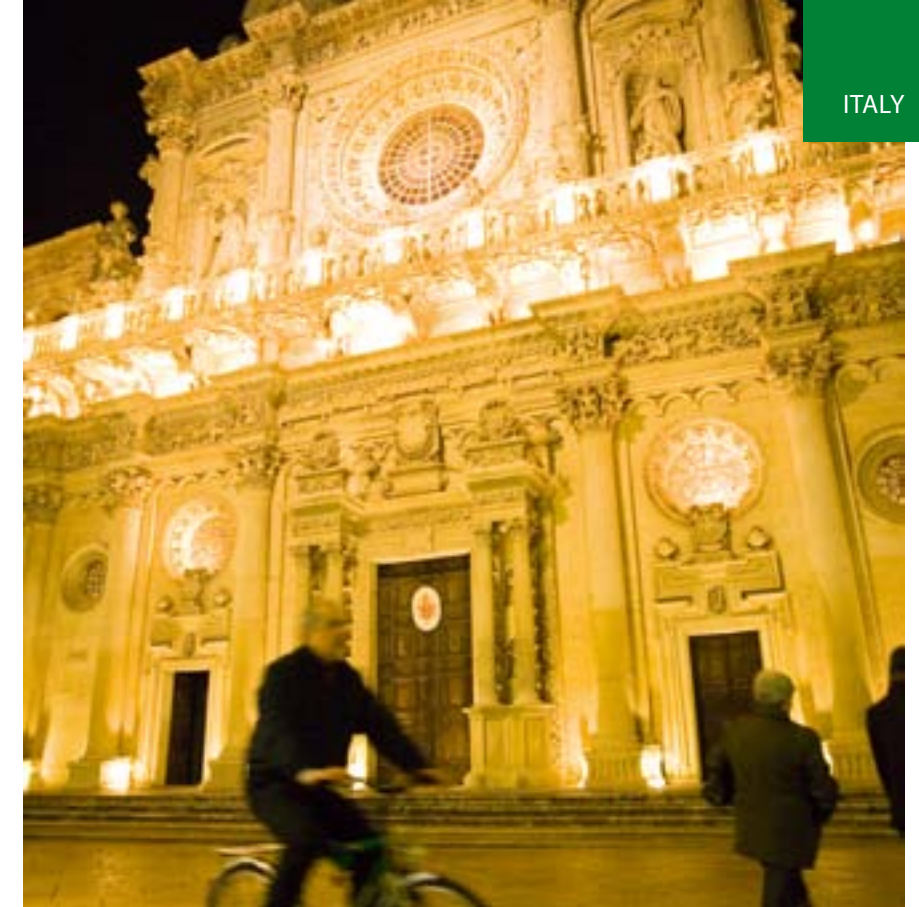
AT BASILICA DI SANTA CROCE, A MENAGERIE OF CREATURES GAMBOL AROUND A HUGE ROSE WINDOW, HEAVED TOWARD THE HEAVENS BY GROTESQUE ANIMALS AND TURKISH ATLANTES